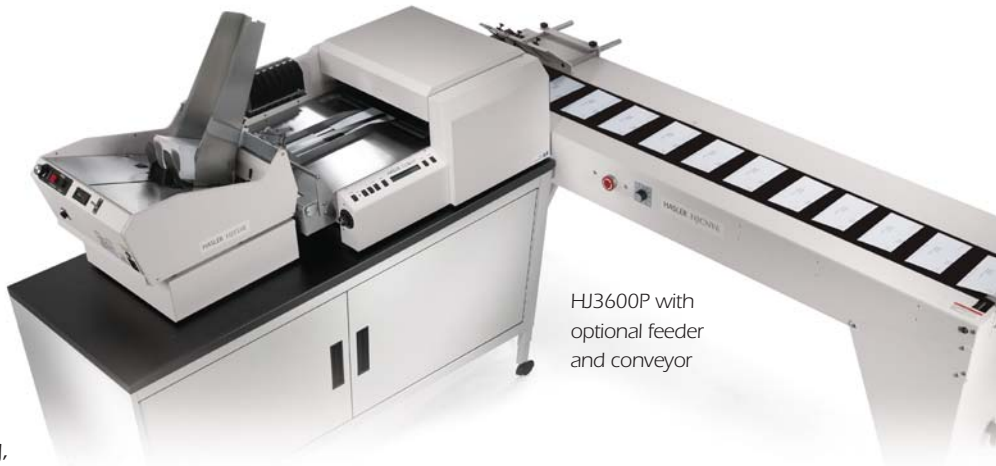
HJ3600P with optional feeder and conveyor

USPS® Approved CASS/PAVE software is compatible with all HaslerJet Address Printers and ensures maximum postal discounts.