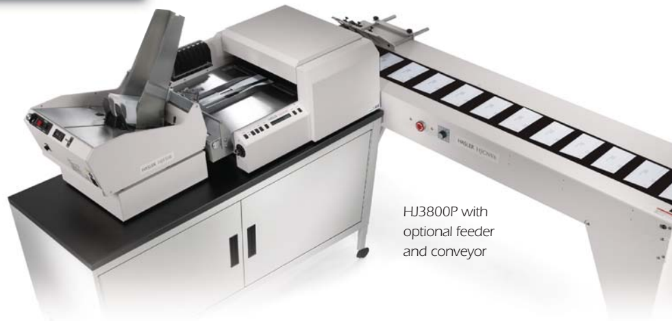
HJ3800P with optional feeder and conveyor